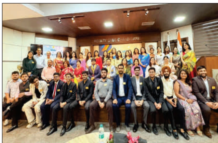
Installation of Rotract Club of Legis Social.