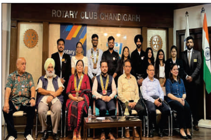
Rotract Club of Chandigarh Installation ceremony on 24th August.